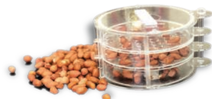
Finally a tool to check grading quality!

Netherlands – The warehouses stock up peanut to the maximum hence the market have not shown import requirements. US, China & Indian peanuts stocks expected ranges between 65,000 to 75,000 MT in warehouses.